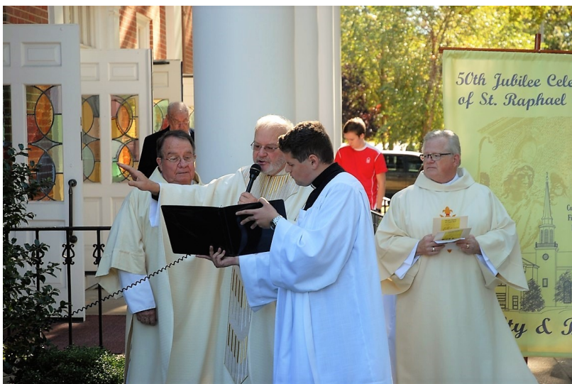
Celebrating the Laying of the Cornerstone of the Church