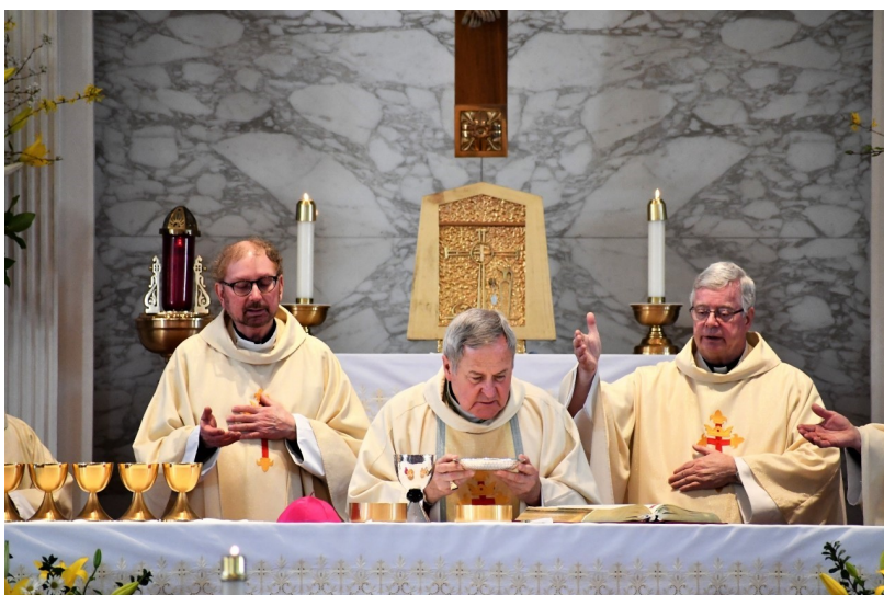
Celebrating the 50th Anniversary of the Dedication of the Church With Archbishop Carlson