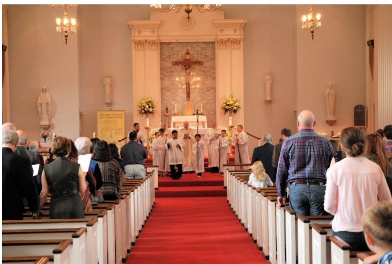
Celebrating the 1st Mass in our Church